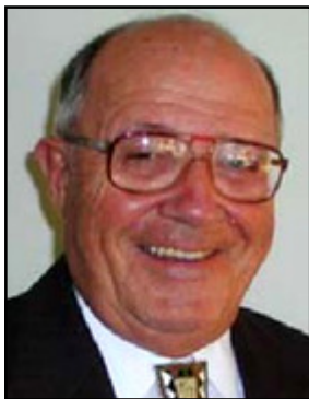
Northeast Square Dancer, November 2008

Last weekend [September 21] the NECCA Clinic took place in Worcester. It drew the biggest turnout that we've had in several years.